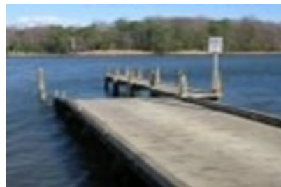
The LPIA Boat Ramp

Contact webmaster@longpointonthemagothy.com if you have any questions.